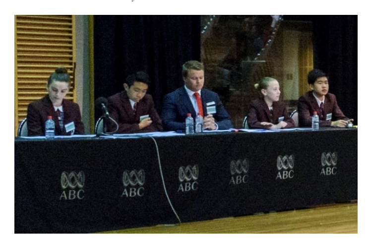
Tensions running high